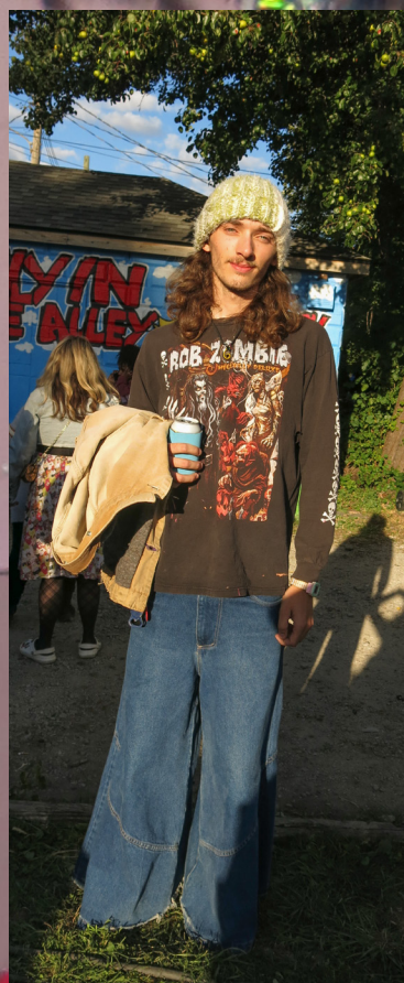
@ Dally in the Alley