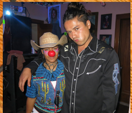
@ Ol' Yeller