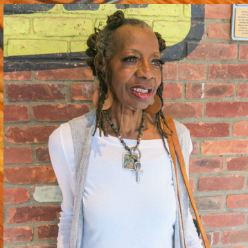
@ Whole Foods