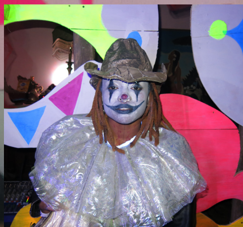
@ Ol' Yeller