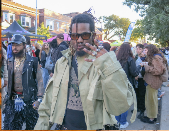
@ Labor Day Fest