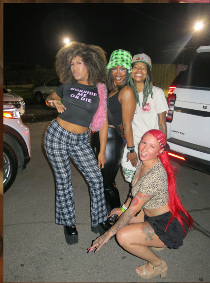
@ Labor Day Fest