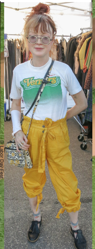
@ Labor Day Fest