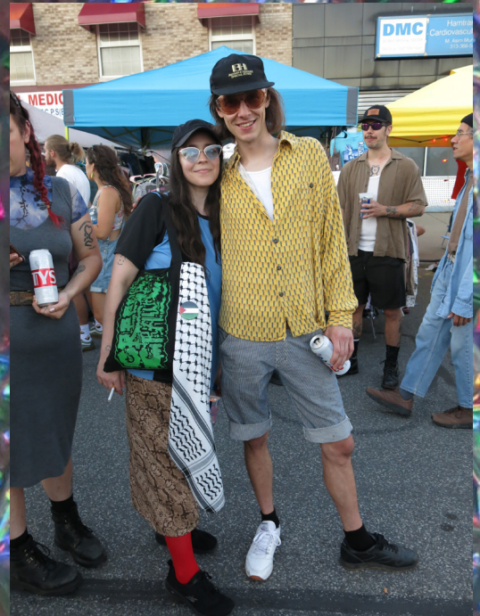
@ Labor Day Fest