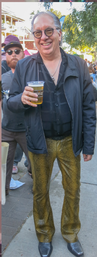
@ Dally in the Alley