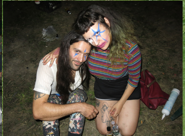
@ Ol' Yeller

Summer is finally over, bringing us to the fifth installment of detroit-coded! Welcome! So far it's been very easy for me to approach beautiful women expressing themselves and ask to take their picture. I don't need much of an excuse to talk to these earth angels and bask in their powerful feminine glow. This time around I made more effort to capture masculine styles and people older than the age of what's expected to be hip or trendy. It's always felt like a bummer that only the youth get to be trend-setters. Also that men seem to be so stuck in a box of what silhouettes are appropriate for them to wear. Whose rules are these? Who is fashion for? Who gets to express themselves? I think the answer should be: Fashion Is For Everyone!! It's a daily experience that we can heighten and level up to decorate our perceived reality, and the reality of all those we cross paths with. Fashion is a form of communication. This has been a theme in my fashion philosophy during detroit-coded and I stand by it. Dressing "age appropriate" is shackling and boring, can we glow up from that mindset please? The Summer 2025 fashion show for Milan Fashion Week featured only models seemingly over the age of 50. I encourage you, detroit-coded reader, to search Summer 2025 mfw on youtube and admire all the older models wearing striking colors and patterns from head to toe.