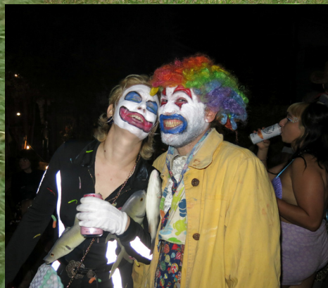
@ Ol' Yeller