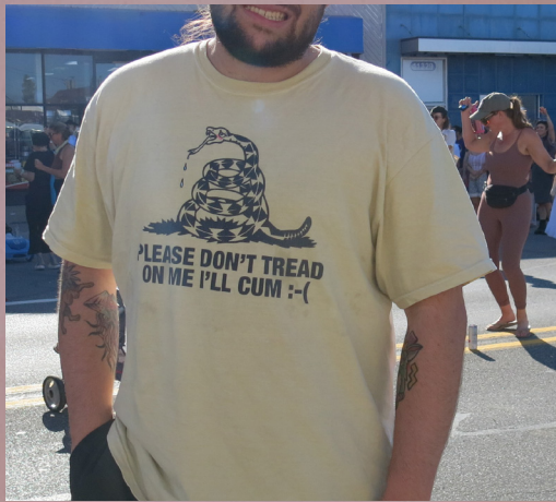
@ Labor Day Fest