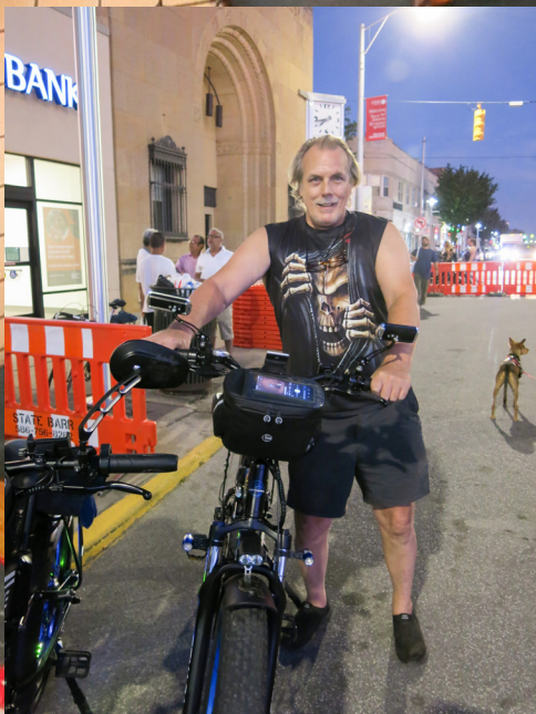
@ Labor Day Fest